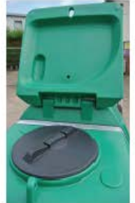
450 mm screw lid and centre 100 mm vented fill cap, with lockable access cover

Hot-dip galvanised steel chassis to highway-specification with rear lights, mudguards and rubber suspension