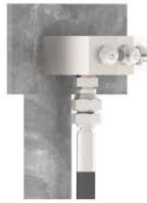
3 x high-pressure mist-throwing nozzles