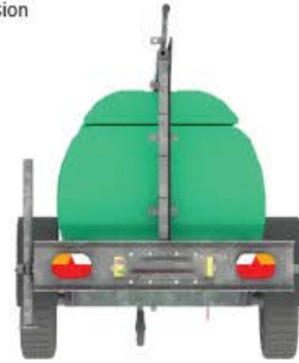
Total width: 1.65 m