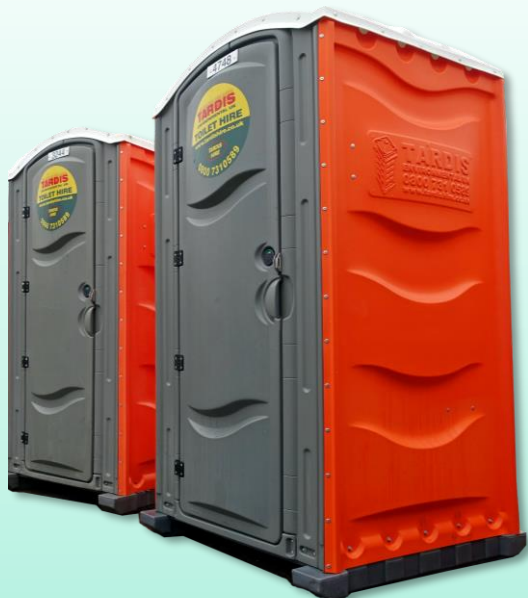
Unit colours may vary

Dimensions: 1166mm Wide x 1215mm Deep x 2316mm High