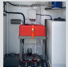
Integrated Diesel/ Electric power