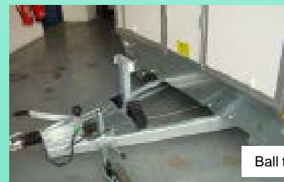
Ball type hitch