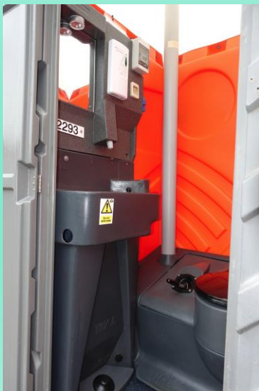
HWPT – FEB 2019